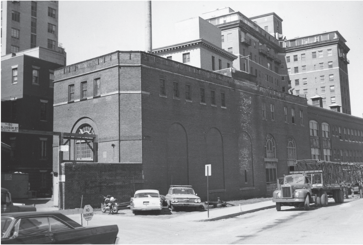
Figure 5.1 The Allen Street Building, which housed MGH Pathology from 1896 to 1956, shown during demolition

conditions in the old Allen Street House (figures 5.1 and 5.2) were not only inadequate but dangerous as well. For example, Dr. Mallory had previously praised the replacement of an old wooden staircase with a new steel one, commenting that it “has greatly increased the safety of the building.” In the course of 1929: